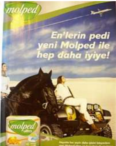
Visual 1.3 (2012, m:O, pg:213)

In visual 1.3 there are three elements which are hard to be used in woman sanitary pad. The perception of women who use sanitary pad, may do safari in desert, ride horse and fly a plane even on their specials are tried to be formed. The use of white color which is the easiest one to get dirty is highlighted a sign of confidence in this sanitary pad and expression is strengthen more with the feature of contrast by using black horse and jeep. In the visual, women's looking into horizon represents moving forward and reference to the "always better" advertisement motto.