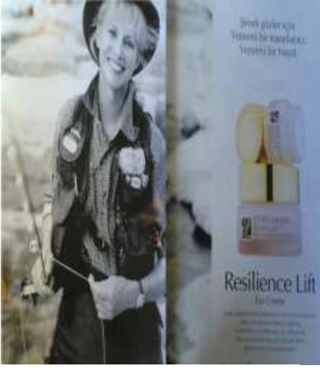
Visual 1.2 (2000, m:S, pg:4-5)

In the Visual 1.2 belonging to 2000's category, woman figure, taken place in cream advertisement produced for women, has been depicted as doing fishing and carrying out this business as professional rather than routine woman. In this example, the impression of women is not different from the man and does everything done by the men by doing flow reference from the specific to the general to the sub conscious with the woman object visual. If you take note of the clothes of the woman (shirt, vest, hat and watch), they resemble to man's wear.